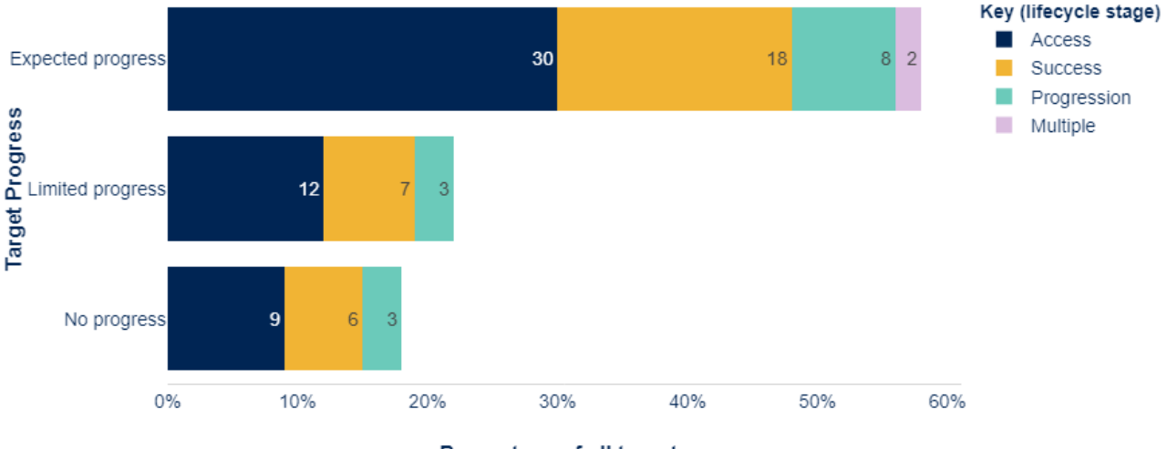
Figure 2: The proportion of targets from the total number of targets by progress category and lifecycle stage