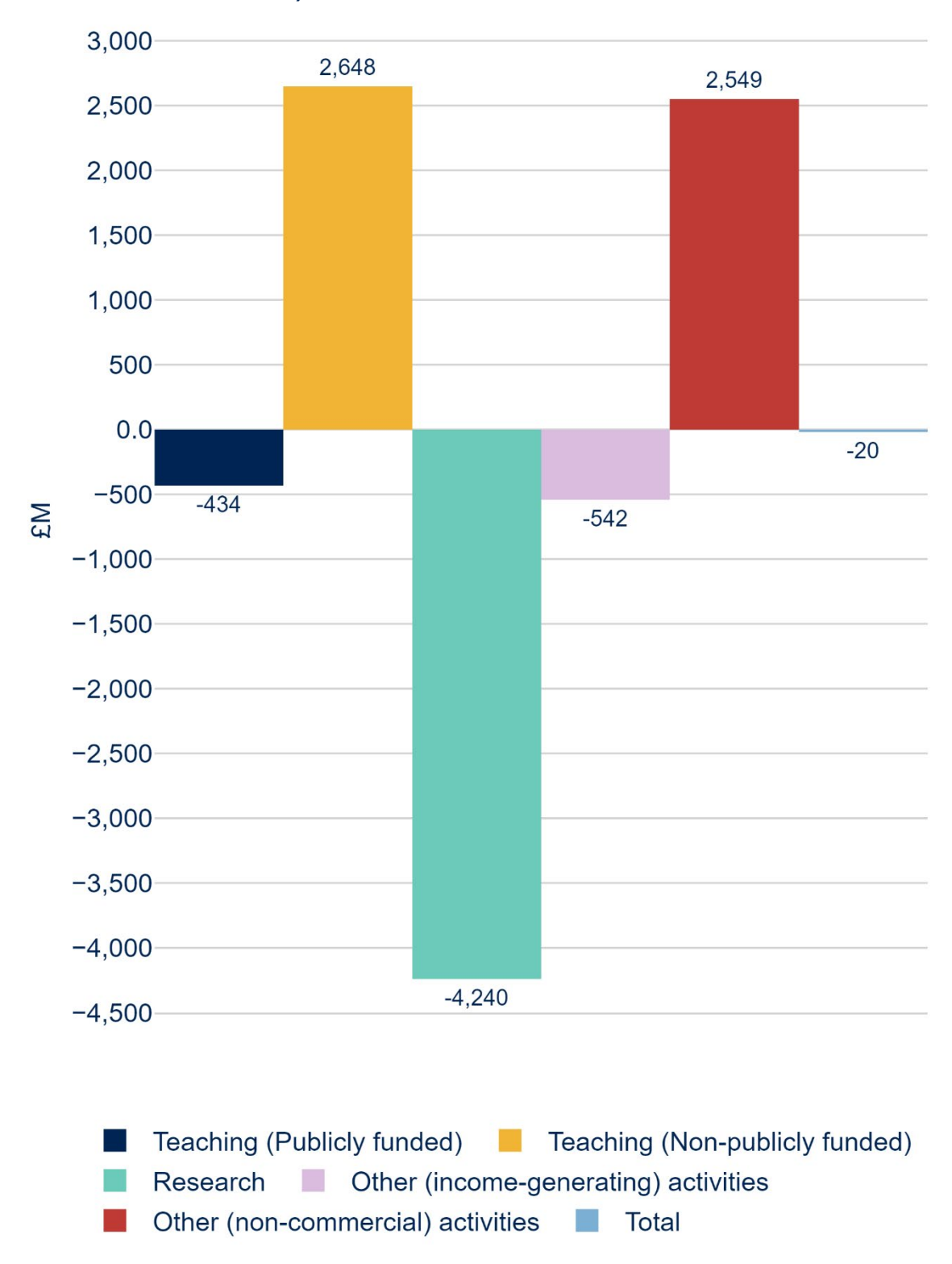
Figure 2: TRAC full economic cost surplus/deficit by activity, 2020-21 (UK higher education institutions)